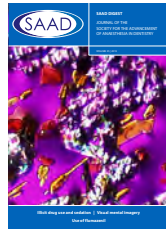
SAAD Digest 2019 Vol. 35

All editions since 2006 are available from the SAAD website , or via the links below.