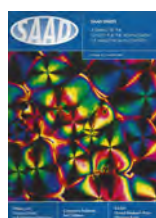
SAAD Digest 2007 Vol. 23