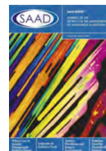
SAAD Digest 2012 Vol. 28