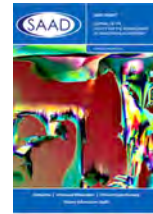
SAAD Digest 2018 Vol. 34