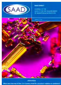
SAAD Digest 2020 Vol. 36