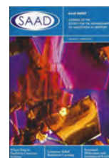
SAAD Digest 2010 Vol. 26