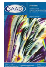
SAAD Digest 2008 Vol. 24