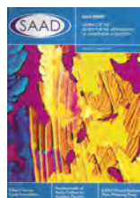
SAAD Digest 2009 Vol. 25