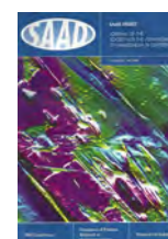
SAAD Digest 2006 Vol. 22