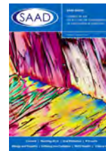
SAAD Digest 2016 Vol. 32