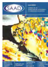
SAAD Digest 2013 Vol. 29