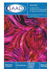
SAAD Digest 2014 Vol. 30