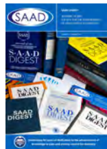
SAAD Digest 2017 Vol. 33