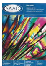
SAAD Digest 2011 Vol. 27