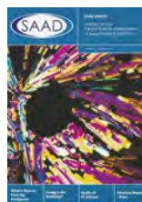
SAAD Digest 2015 Vol. 31