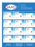
SAAD Digest 2023 Vol 39